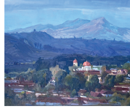
Jewel of San Juan Capistrano