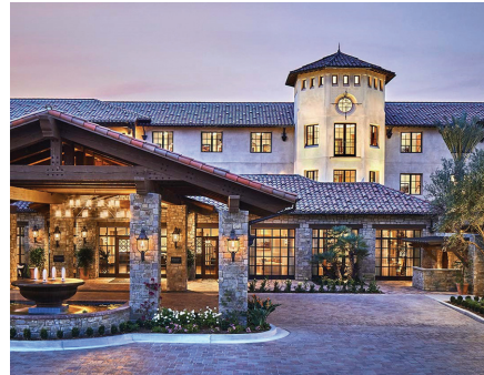
The Inn at the Mission A Marriott Autograph Hotel