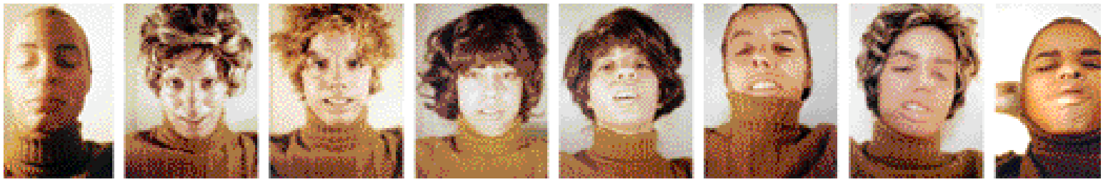
Untitled (Facial Cosmetic Variations), 1972 35 mm color slides

This exhibition examines the brief yet prolific career of Ana Mendieta and traces her development from early performances of the 1970s to sculpture and objects from the early 1980s made of fragile, earthen materials. Born in Havana, Cuba in 1948, Mendieta came to the United States, in 1961, without her parents. She and her elder sister joined fourteen thousand Cuban children whose exile from Fidel Castro's Communist revolution in Cuba was aided by the United States Catholic Church. Placed in foster care in Iowa, the Mendieta sisters would not see their parents again for many years. Mendieta's personal and professional development was greatly informed by the painful experience of exile as well as the intersection of Caribbean and North American cultures. The artist later commented: