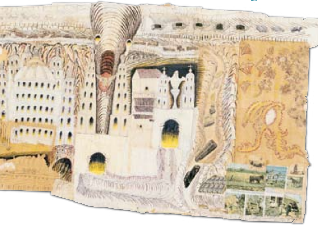
Martín Ramírez, Untitled (Landscape) , ca. 1948–63. Crayon, pencil, watercolor, and collage on pieced paper. American Folk Art Museum, extended loan of Audrey B. Heckler.

nestles over a chalice or baptismal font next to a California Revival/Spanish colonial grouping of buildings with red-tile roofs. A fantastic animal burrows from the earth between the pair of neo-Gothic towers that recall the monumental cathedral of Guadalajara, the capital of Jalisco.