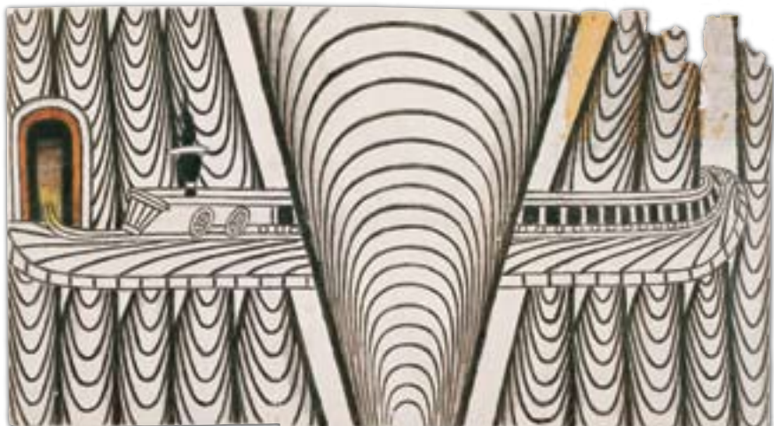
Untitled (Train and Tunnel) , ca. 1950. Crayon and pencil on pieced paper. Collection of Estelle E. Friedman.

W here does this train go to? To Drawing City.